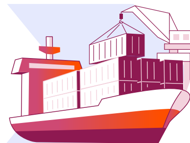
Ultimate consignees (in maritime transport)