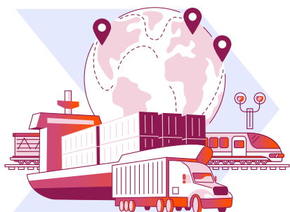
Carriers operating in maritime and inland waterways, road and rail